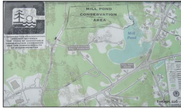
Mill Pond – Conservation Area visitor location map.

Maps of current land use, depicting the number and location of residences, were reviewed during preparation of this Action Plan for Barnstable. This coverage area of impervious surfaces is important to consider in quantifying phosphorus loading to the ponds from the surrounding watershed due to surface runoff. The density of development is a factor in phosphorus loading from septic systems.