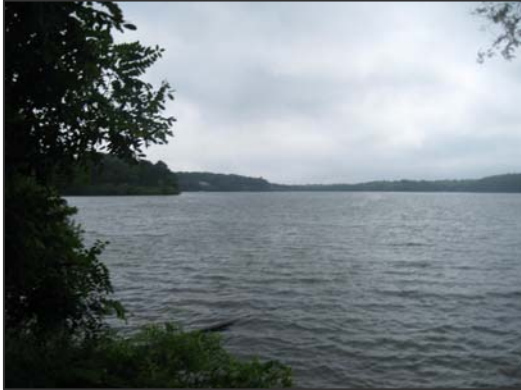
Mystic Pond (Indian Ponds)

ponds, nitrogen is usually the limiting nutrient for primary production of coastal ecosystems. Nitrogen enrichment has resulted in degradation of estuarine and marine water quality and habitat conditions, and wastewater is a major source of nitrogen. Scientists and regulators from the EPA, the MA DEP, the academic community and the Cape Cod Commission have supported the coastal municipalities in a systematic process to define the need for and extent of reductions in nitrogen loading (MA DEP 2003 “The Massachusetts Estuaries Project Embayment Restoration and Guidance for Implementation Strategies”). Findings of this analysis are now being incorporated into land use and facilities decisions across Cape Cod.