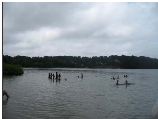
Hamblin Pond (Indian Ponds)