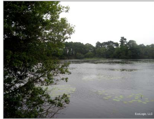
Aunt Betty's Pond – Ultra-shallow, very productive with submerged and floating-leaved plants evident.

Eutrophication , the term for both the process and the effects of enrichment of surface water systems (including lakes, ponds, estuaries, and reservoirs), is a significant water quality concern for many aquatic ecosystems. As aquatic systems become increasingly enriched with plant nutrients, organic matter and silt, the result is increased biomass of algae and plants, reduced water clarity, and ultimately, a reduction in volume. Aesthetic quality and habitat conditions are degraded, and affected waters may no longer be suitable for drinking water or recreation.