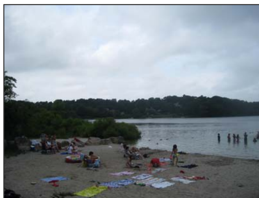
Hamblin Pond: Recreational use

This report sets forth recommendations to the Town of Barnstable as they integrate management of the inland ponds into an overall nutrient management plan. The recommendations consider effectiveness (both short-term and long-term), cost, permitting issues and recreational impacts. The recommended actions include institutional, technical and public education components. Some recommendations are town-wide, while others are directed to specific ponds. An overall implementation strategy is presented that defines priority actions and sequencing of recommendations.