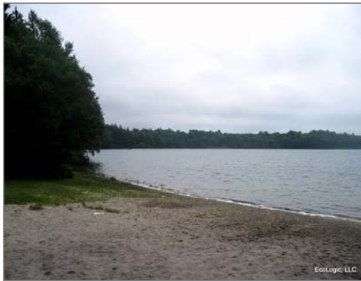
Shubael Pond – Deep, with exceptionally clear water, sandy bottom.

This often-cited quote from a classic limnology text provides excellent context for reviewing the current and future conditions of the ponds of Barnstable. The ponds may be arrayed along a continuum from open, clear, water with little visible algal growth to extremely shallow, productive systems well on their way to becoming wetlands.