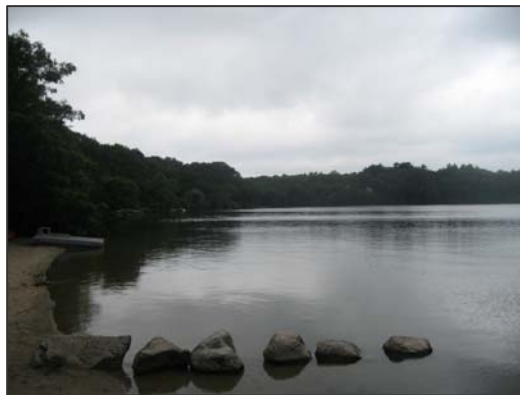
Middle Pond (Indian Ponds)