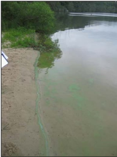
Lovell's Pond, with algal bloom July 2009

Limnologists have developed guidelines to delineate the transition between trophic states based on phosphorus, water clarity, chlorophyll-a, and deep water dissolved oxygen concentrations ( Table 3 ). However, assigning a lake or pond to one category still requires professional judgment considering the cumulative evidence of water quality conditions and the level of productivity ( Table 4 ).