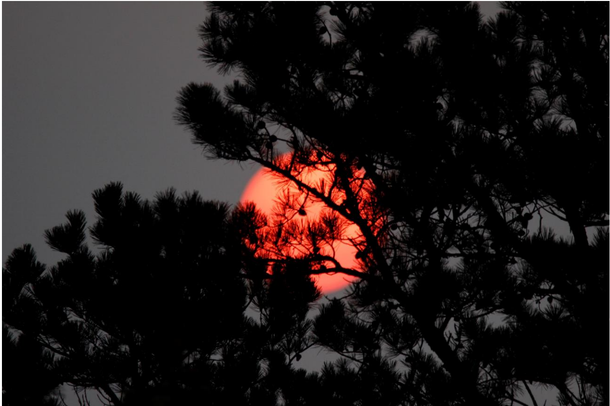
Sunrise at Sandy Neck on Thursday, September 17, 2020.