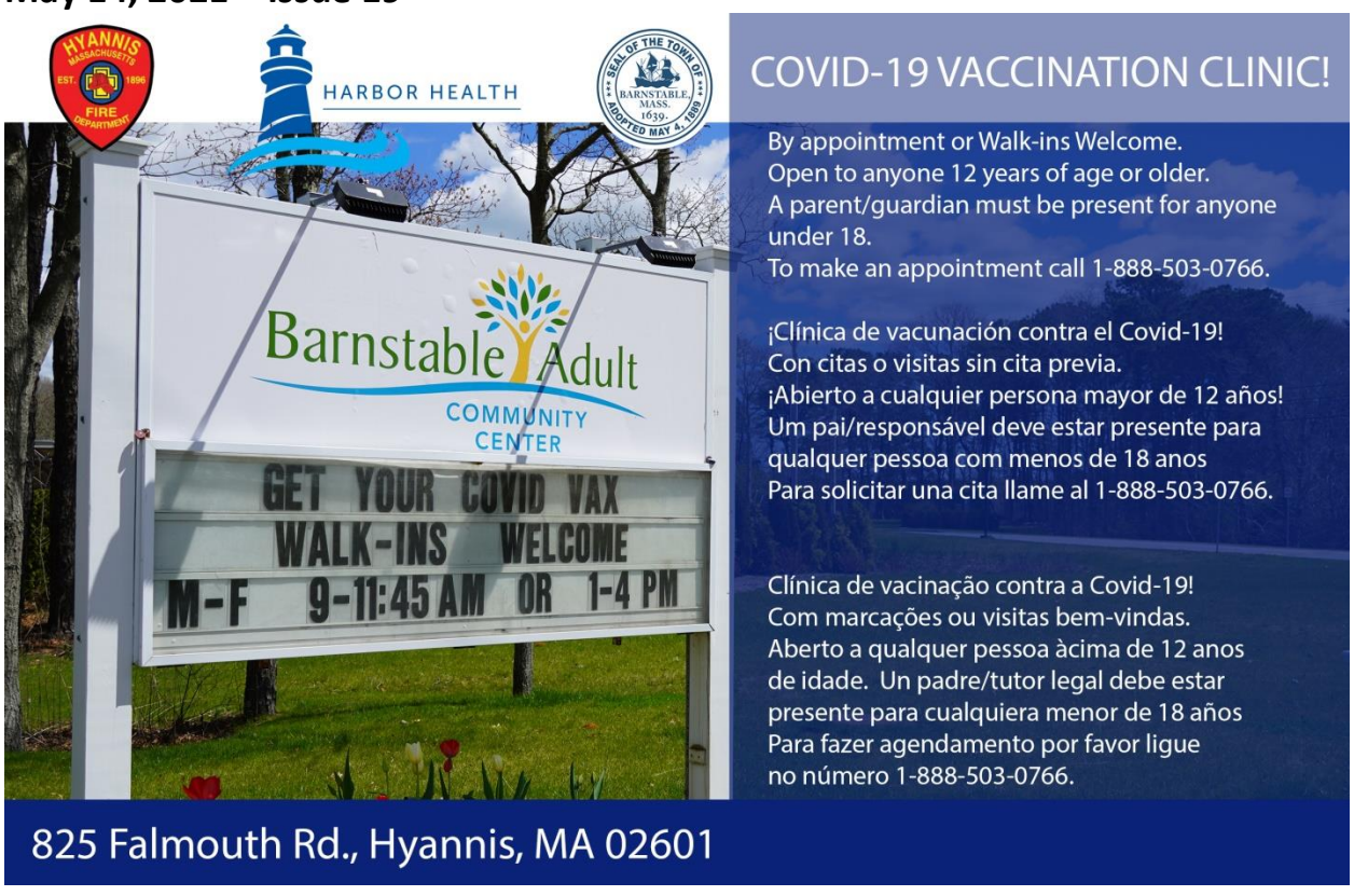
12-15 year olds now eligible for Pfizer vaccine with parental/guardian consent.

Town Calendar Official Agendas Legal Notices