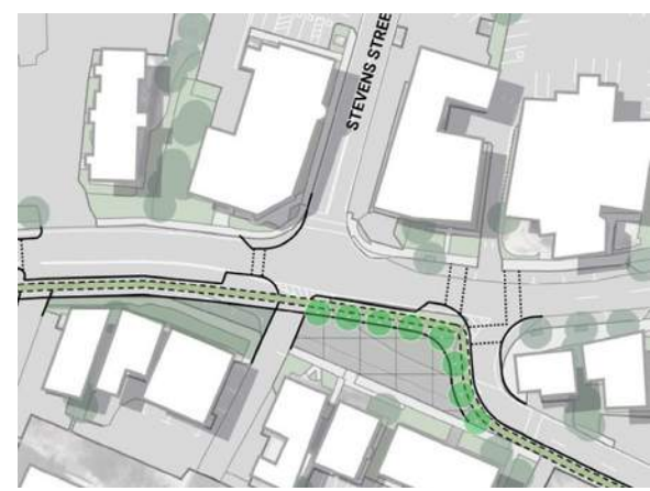
Proposed concept at South and Main intersection

For more information and updates, check out the project website below or click the QR codehttps://tinyurl.com/hyannisgreatstreets