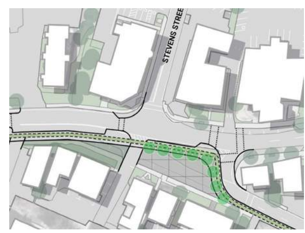
Proposed concept at South and Main intersection

For more information and updates, check out the project website below or click the QR codehttps://tinyurl.com/hyannisgreatstreets