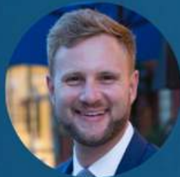
Sen. Julian Cyr

Film screening and panel discussion with: