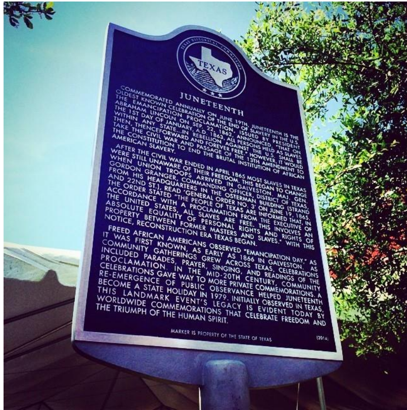
Photo Credit: Historical marker in Galveston. Please credit to Texas Historical Commission / @txhistcomm.