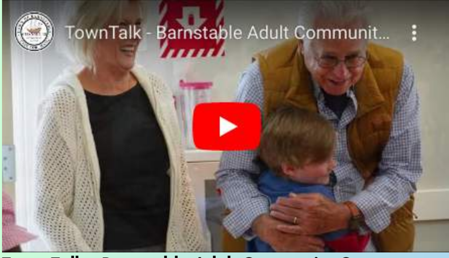
Town Talk - Barnstable Adult Community Center Kindergarten Patriotic Song Sing Along