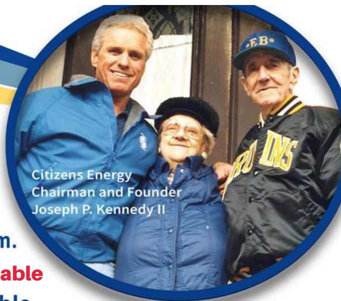
Citizens Energy Chairman and Founder Joseph P. Kennedy II

get an average of $50 in free credits each month toward your Eversource bill.