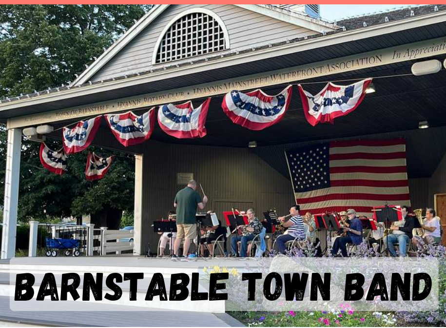
BARNSTABLE TOWN BAND

Every Wednesday 6:30-7:45pm Hyannis Village Green Bring blankets/ beach chairs & enjoy hometown musical charm!