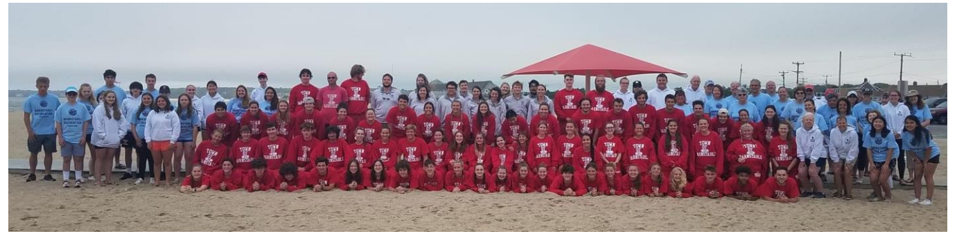
2021 Aquatic Staff on Opening Day – June 26

Town Calendar Official Agendas Legal Notices Barnstable Public Schools Connect with us on: FACEBOOK | TWITTER