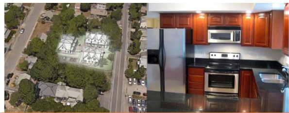
Example Floor Plan