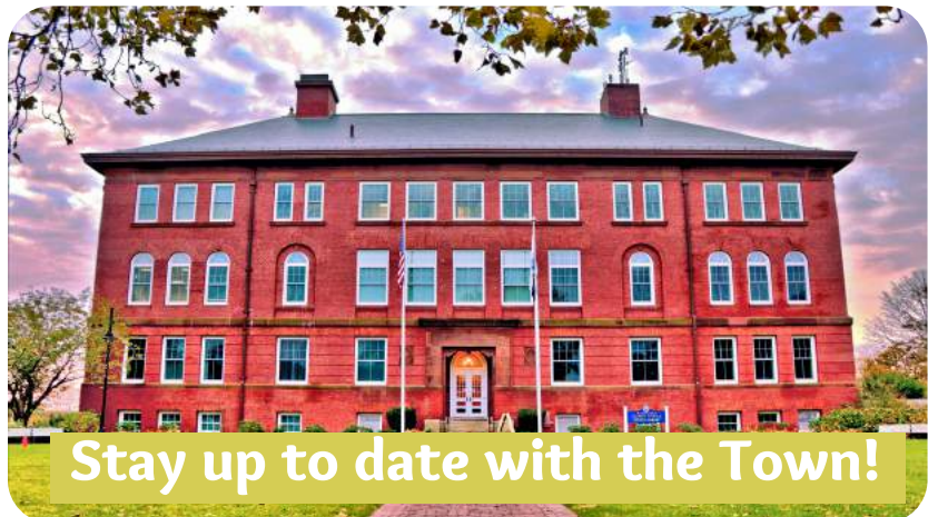
Stay up to date with the Town!

Was this issue of eNews forwarded to you? YOU CAN SIGN UP HERE TO RECEIVE "Barnstable eNews" directly to your email box.