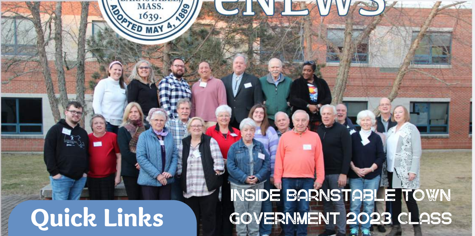
INSIDE BARNSTABLE TOWN GOVERNMENT 2023 CLASS