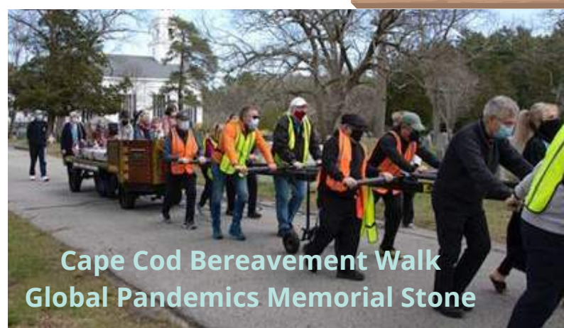
Cape Cod Bereavement Walk Global Pandemics Memorial Stone

Barnstable School Committee Meeting Update 04-06-2022