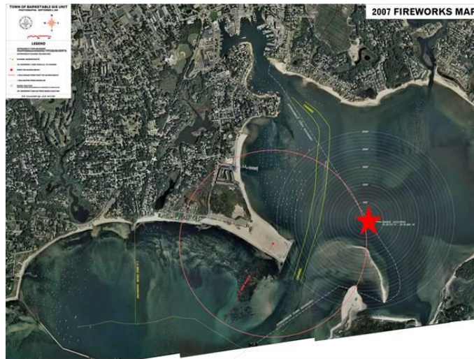
Figure 1: Barge location as approved in 2007. Piping plover (state and federally listed “threatened”) and least tern (state listed “special concern”) identified on Kalmus Beach.