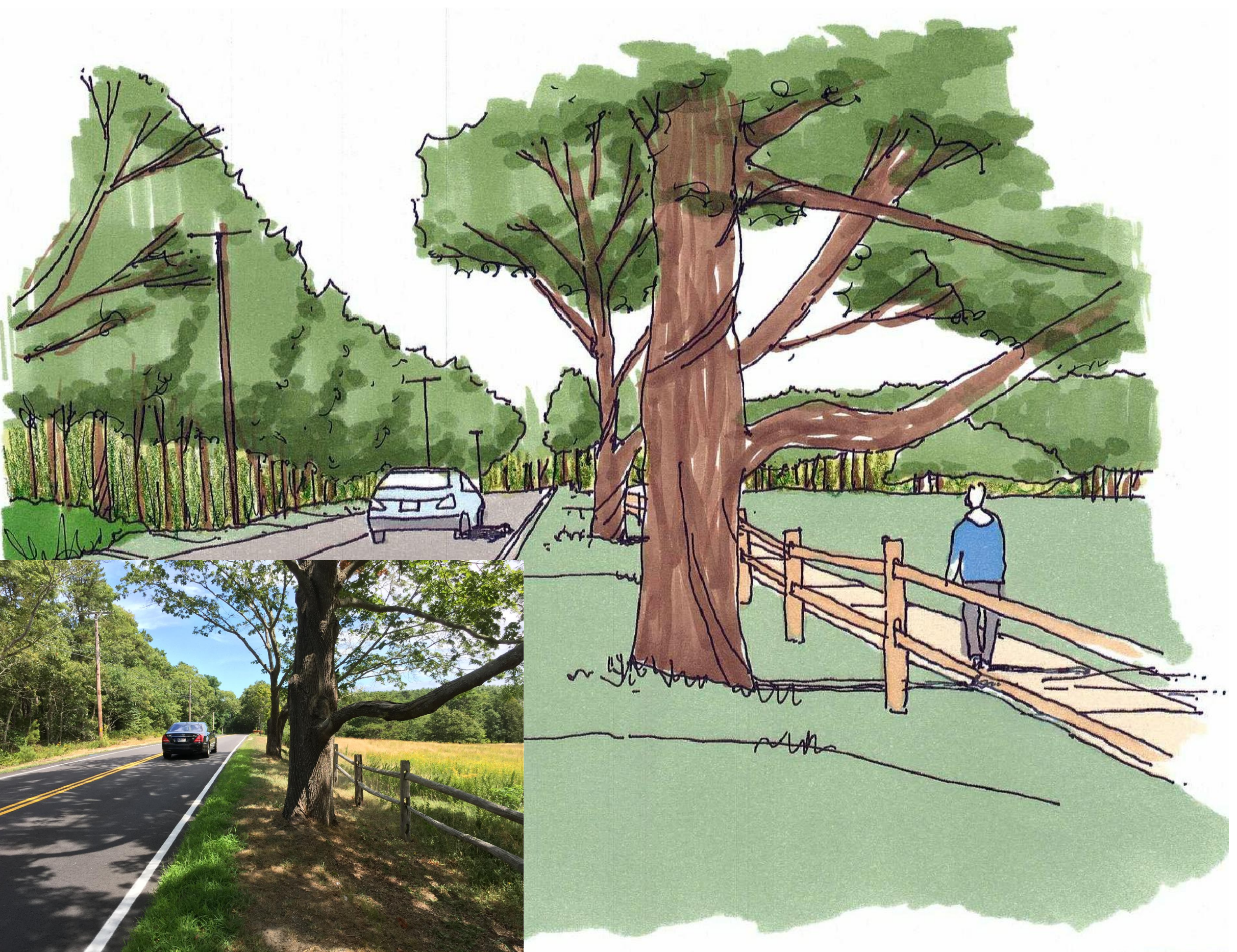
PATH AT FIELD D