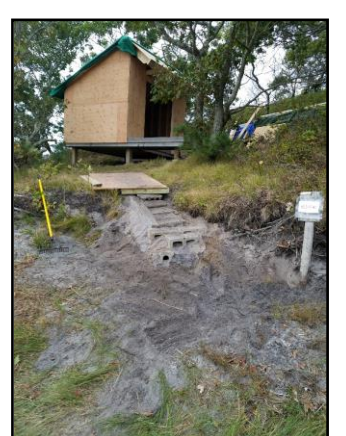
This is the current condition after the busy day! More work needs to be done to complete the project and everyone will be told the next date.